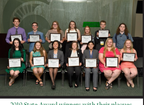
2019 State Award winners with their plaques

Michigan 4-H true leaders ages 11 and older have an opportunity to be recognized for the great work they do in 4-H by completing a state award application. A Michigan 4-H State Award is the highest honor bestowed on a Michigan 4-H member and provides an opportunity to receive recognition for their engagement in rich learning experiences that result in outstanding knowledge and life-skill development.